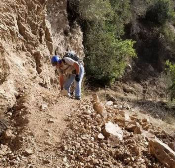
SoCal Hikers & Trail Builders removing slides off the Sam Merrill Trail on Echo Mountain