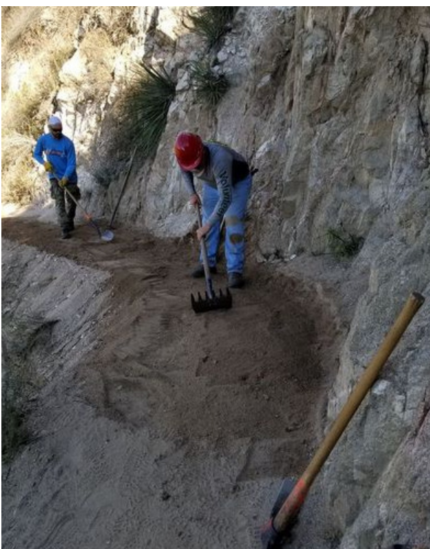
SoCal Hikers & Trail Builders smoothing the Sam Merrill Trail on Echo Mountain