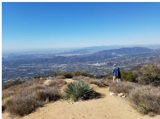
Clear view from Muir Peak Feb 24, 2018

Our second outing was our annual maintenance of Muir Peak before the annual Sierra Club convergence hikes. Lot of overgrown buck thorn and Manzanita. It's great that the fire roads have been recently cleared, didn't scratch my car this time.