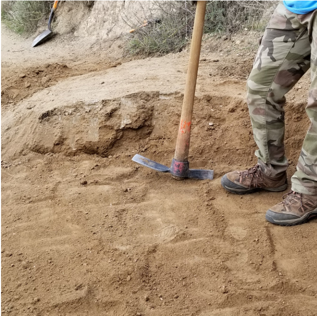
SoCal Hikers & Trail Builders removing slide off the Sam Merrill Trail on Echo Mountain