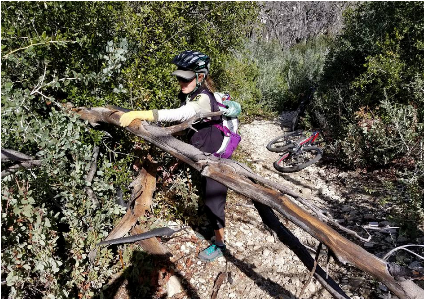
Angeles mountain bike patrol & Cobra taking care of the down trees Charlton Flats CG and Silver Moccasins trail and Vetter trails.