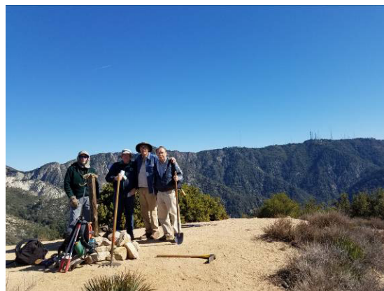
Lunch on Muir Peak

WHAT'S PLANNED: Depending upon the number of people showing up and the weather, we can do trail maintenance of tread widening and cutting back brush on any of our usual trails: 1) Mt Lowe West Trail driving up Mt Lowe fire road to where it starts above Mt Lowe Campground. 2) Mt Lowe East Trail at the mid-section hiking from Eaton Saddle past the junction to the summit of Mt Lowe down towards Inspiration Point. 3) Colby Canyon Trail from where we left off from Angeles Crest. As you can see, all of the work is around the halfway points of the trails, which means more hiking.