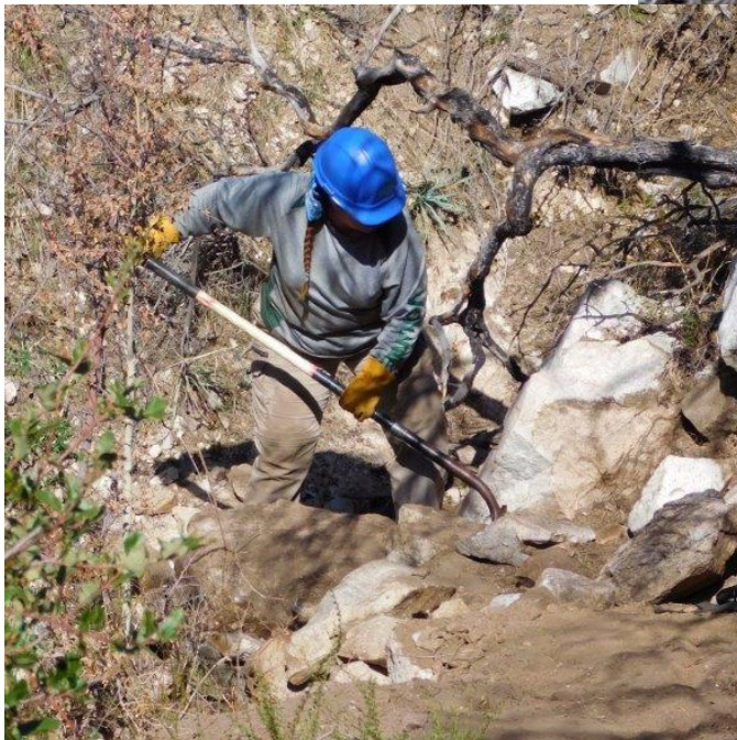
Lauren removing a slide off Dawn Mine Trail