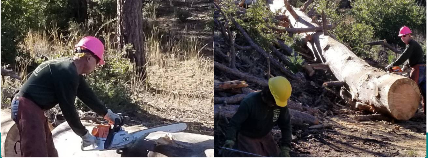
Angeles mountain bike patrol & Cobra taking care of the down trees Charlton Flats CG and Silver Moccasins trail and Vetter trails.