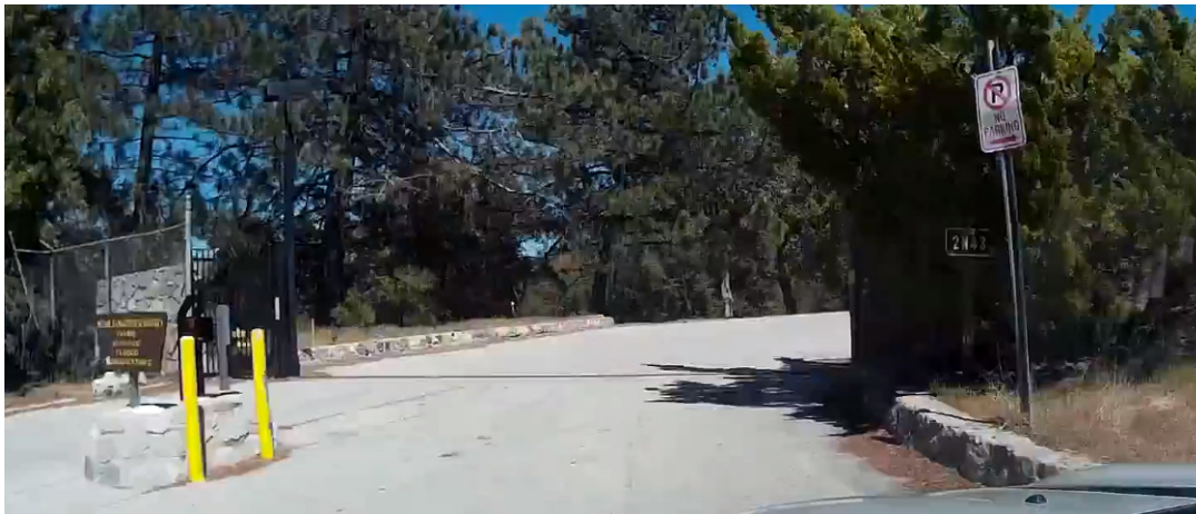
Mount Wilson entrance as of 2018

Mount Wilson Institute now operates the Cosmic Café restaurant.