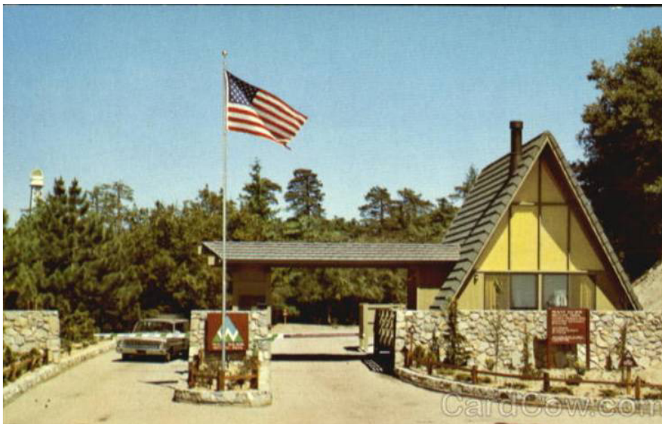
This was the entrance to the park

A contract has been let for the construction of a dam that will provide a three-acre lake for fishing and small boats.