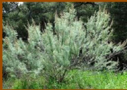
California sagebrush ( Artemisia californica )

What is it? Where did it come from? How has it survived in this environment?