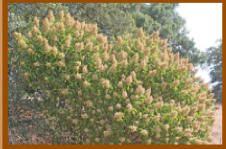
Laurel sumac ( Malosma laurina )

Join us for a hike through the Park as we try to answer these questions and more.