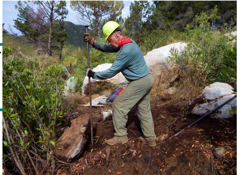
Thurman moving boulders off trail near The Pines