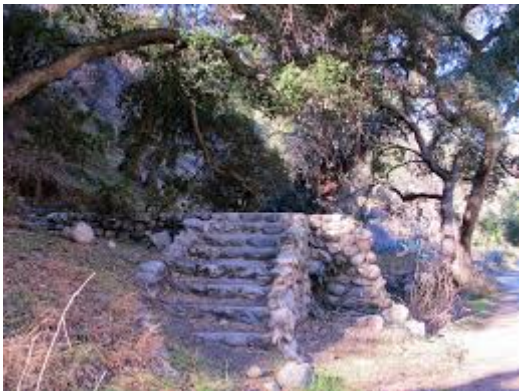
Views while hiking the Gabrielino Trail

Explore the Arroyo Seco ! Take a Hike! Take the Gabrielino Trail, the main Arroyo trail, up the canyon to Paul Little Picnic Area to the Brown Mountain Dam. Teddy's Outpost will be the first stop on the trail.