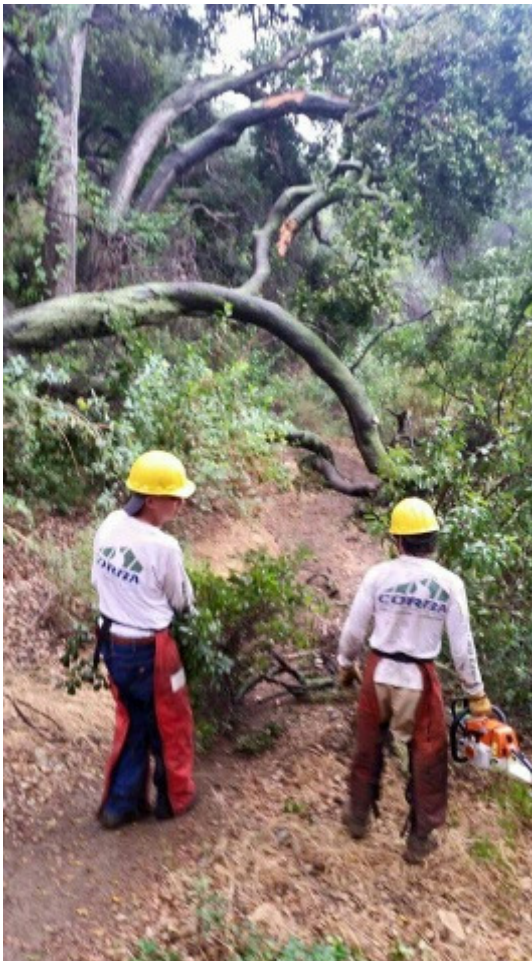
B-Sawyers at work