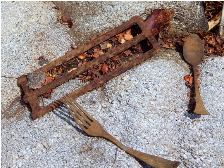
Relics found at The Pines