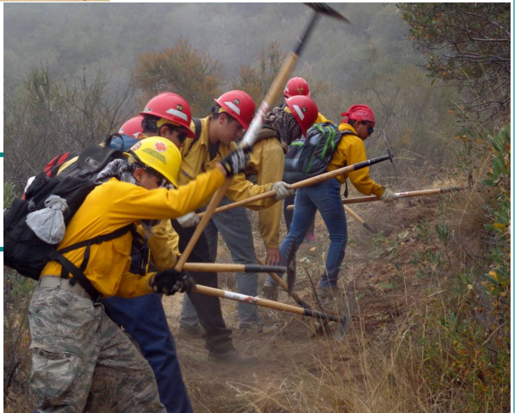
WS Hart students clearing a trail of brush by Kevin Sarkissian