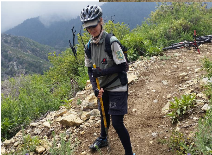
Angeles Mountain Bike Patrol working on the Strawberry Peak trail