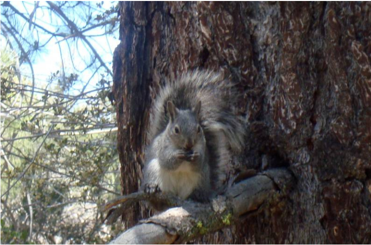
A squirrel in the Angeles Forest