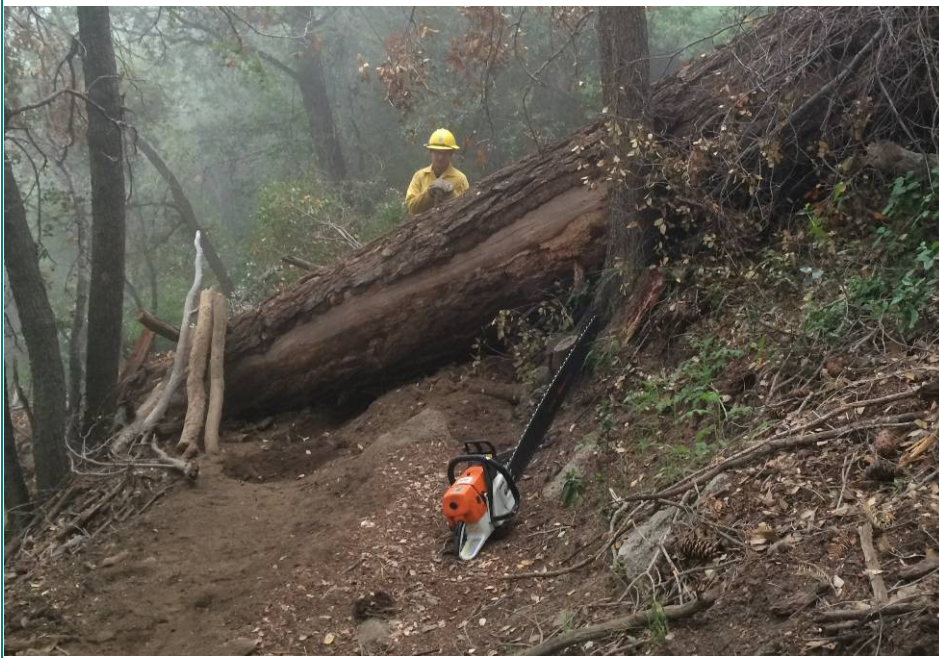
Gregory Stenmo of Little Tujunga IHC getting ready to remove a tree on the Wintercreek trail