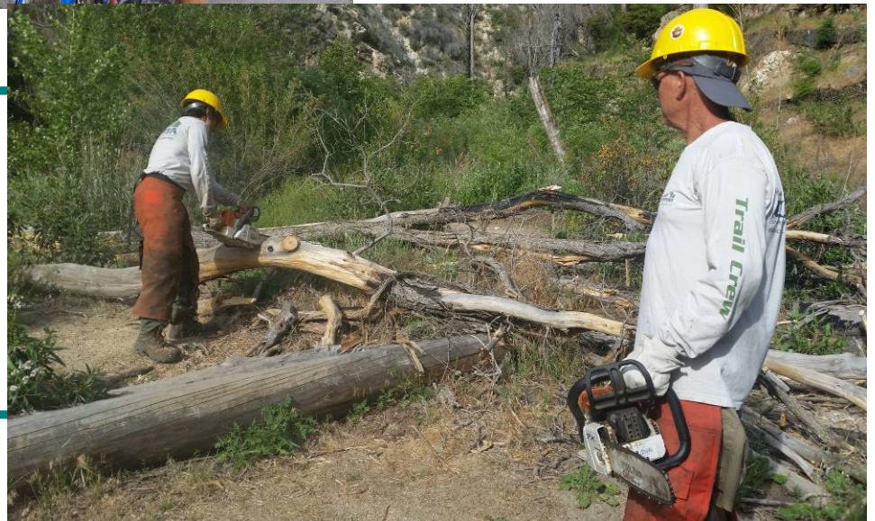
Angeles mountain bike patrol/Corba removing downed trees off the Gabrielino trail