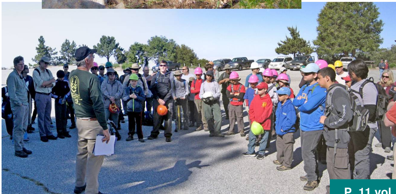
Safety lecture prior to work on National trails day