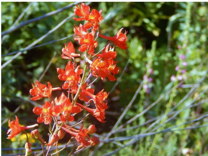
A blooming plant in the Angeles Forest

Questions? Please contact PCTA Volunteer Programs at (916) 285-1838 or at volunteer@pcta.org