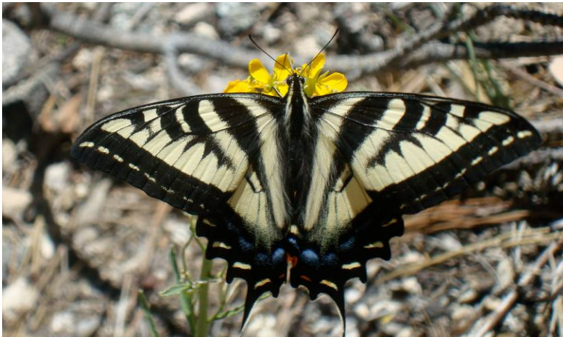
A Butterfly in the Angeles Forest

We work on the trails almost every Saturday.