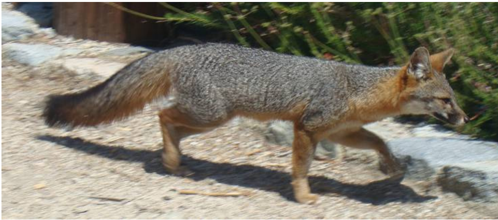
A fox in the Angeles Forest by Neide Torres

While website is under development, you can visit and check out the website.