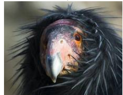
A condor fresh from the hairdresser