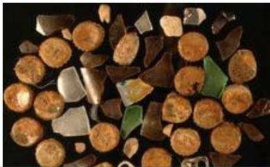
Stomach contents of expired condor chick

This is a real opportunity to make difference in the recovery of wild condors. If you can help out on either or both days, we'd love to have you. There's a lot of ground to be covered. Sturdy teens and adults welcome. Sign up below.