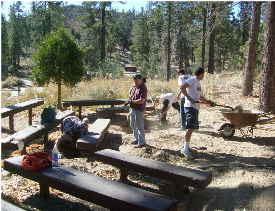
The Boy Scouts finishing rebuilding the amphitheater and repainted the benches at the Chilao Visitor Center