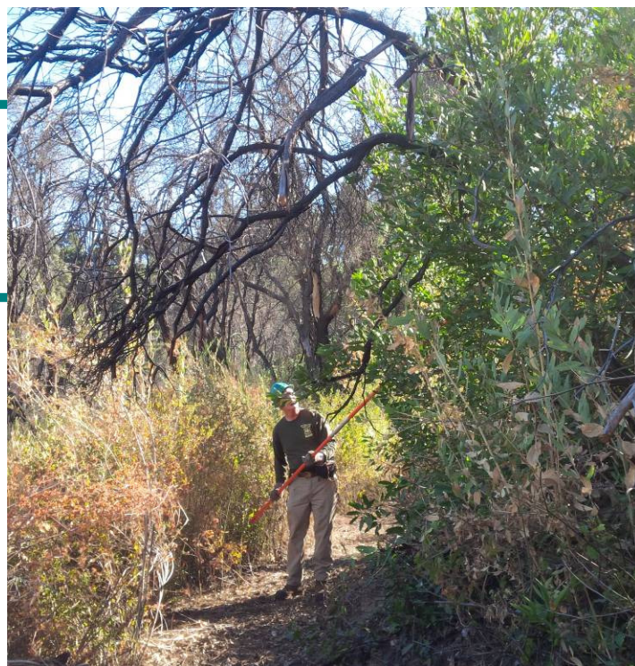
David Ledford using a pole saw to remove low laying branches from the Grizzly Flats Trail.